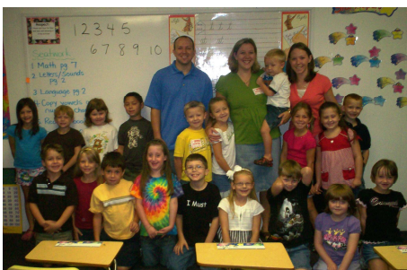
1st Graders at Tabernacle Christian School Gardendale, Alabama