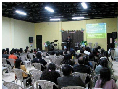
Anniversary Sunday in new auditorium